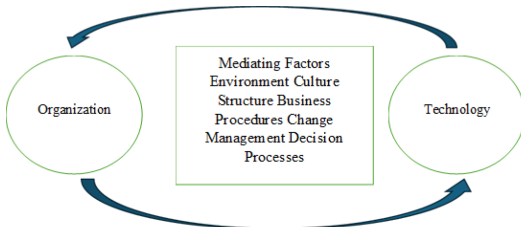
Figure 1. Relationship between Organization and Technology