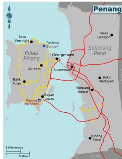
Figure 2 Map of Penang, Malaysia.