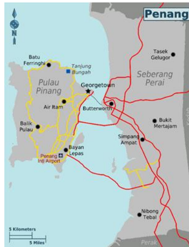
Figure 2 Map of Penang, Malaysia.