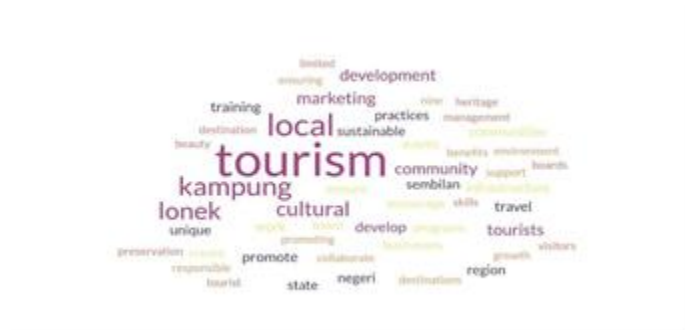
FIGURE 2: WORD CLOUD

In Kampung Lonek, the theme of technology manifests in several intriguing ways, reflecting a dynamic fusion of traditional values with modern innovations. Here are some key findings and discussions regarding the technology theme in Kampung Lonek: