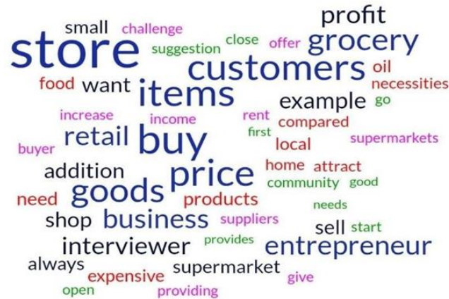
Word Cloud Analysis